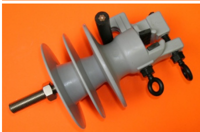
Kabelführung seitlich Cable at the side