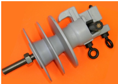
Kabelführung oben Cable on top